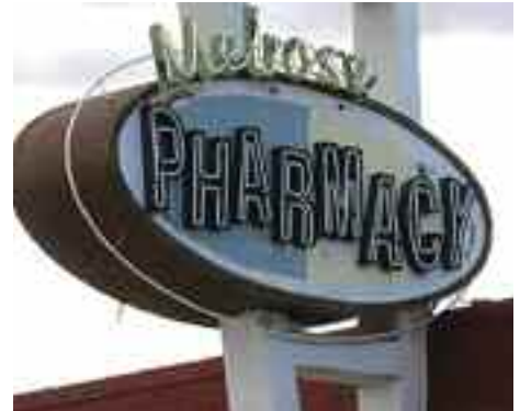
18) Pharmacy - professional and friendly service, old-school style! www.mymelrosepharmacy.com

HOLLYWOOD REGENCY, 708 W. MONTECITO AVE, PHOENIX, AZ, 602.277.5765