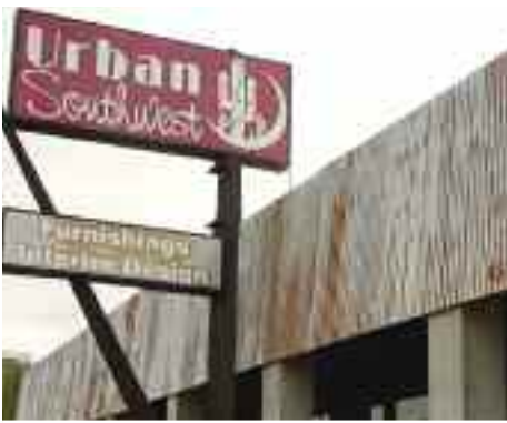
13) Wall Art - Weavings - Gifts - Lighting - Fountains - Vintage iron from the Mediterranean Old doors from Mexico and Europe - Modern to Rustic Furnishings and more. www.urbansouthwest.com

URBAN SOUTHWEST, 1016 E. CAMELBACK RD, PHOENIX, AZ, 602.266.3311