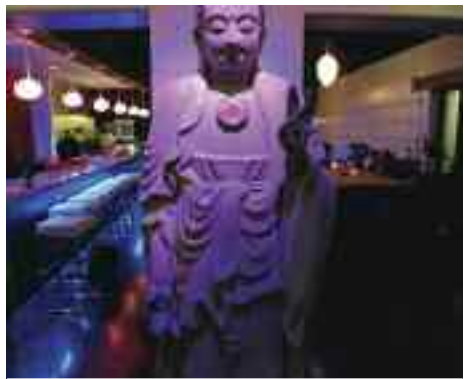
45) The dishes at Sens are served in small portions to allow you to sample the many different and exotic foods that are offered on our menu. www.sensake.com

MATT'S BIG BREAKFAST, 801 N. 1ST ST, PHOENIX, AZ, 602.254.1074