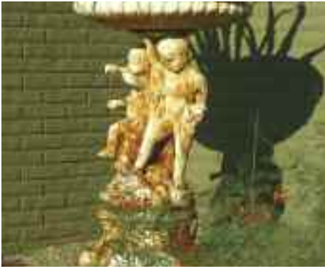
16) An eclectic urban furnishings boutique. Fashioned with Asian, Indian, Indonesian and European furnishings, antiques, accessories, garden, architectural elements, large selection of gifts and Trapp candles.

PARIS ENVY, 4624 N. 7TH AVE, PHOENIX, AZ, 602.266.0966