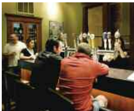
47) Restored bungalow serving local and regional craft beers, boutique wines, and an extensive menu of original bar snacks. Serving food Tues thru Sun until 11, drinks until midnight weekdays, 2 AM weekends.

BUNKY BOUTIQUE, 812 N. 3RD ST, PHOENIX, AZ, 602.252.1323