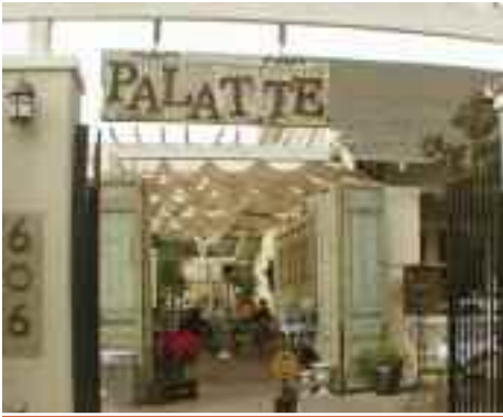
40) Set in a historic bungalow in downtown phoenix, Palatte serves funky american cuisine with a french accent. Focus on fresh local and organic as much as possible! www.downtownbrunch.com

CIBO, 603 N. FIFTH AVE, PHOENIX, AZ, 602.441.2697