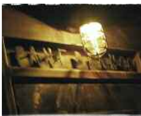
23) Tuesday - Saturday 11AM - 3PM. Take-out only. www.pizzeriabianco.com

HAUS MODERN LIVING, 4700 N. CENTRAL AVE, PHOENIX, AZ, 888.894.4287