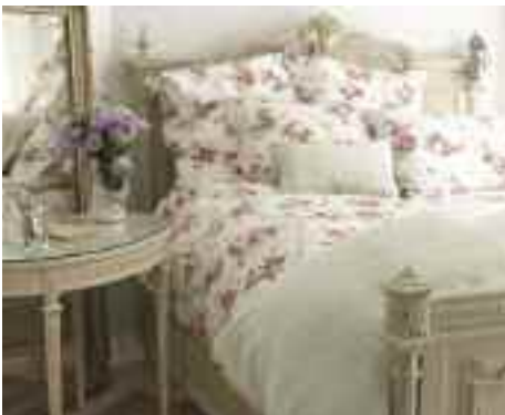
19) Vintage home furnishings, chandeliers, salvage, bedding and baby by Rachel Ashwell Shabby Chic, Bella Notte Linens and House, Inc. The most extensive collection of paper arts supplies. ShopMelroseVintage.com

MELROSE PHARMACY, 704 W. MONTECITO AVE, PHOENIX, AZ, 602.277.4714