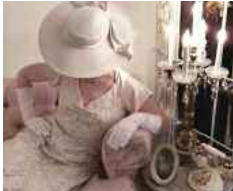
17) A glamorous and eclectic mix of vintage furniture, accessories, jewelry and clothing. 2007 New Times Best of Winner, Wed.-Fri. 11-6; Sat. & Sun. 11-5, or by appt.

FIGS HOME & GARDEN, 4501 N. 7TH AVE, PHOENIX, AZ, 602.279.1443