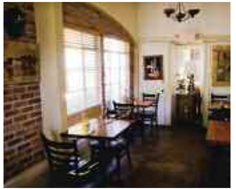
39) Offering a wide selection of authentic Italian cuisine, prepared fresh from locally grown and imported ingredients in a rustic and charming old house setting. Lunch and dinner. www.cibophoenix.com

BARRIO CAFE, 2814 N. 16TH ST, PHOENIX, AZ, 602.636.0240