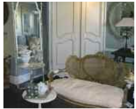
15) Vintage and French-inspired interiors. Home furnishings, accessories, garden and gifts with Parisian flair. www.parisenvy.com

DUCK AND DECANTER, 1651 E. CAMELBACK RD, PHOENIX, AZ, 602.274.5429 ONE NORTH CENTRAL AVE, PHOENIX AZ, 602.266.6637