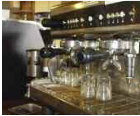
41) Coffee with a Conscience. Coffee, tea, sandwiches, baked goods, smoothies and more. Free wi-fi and covered garage parking. Hours: M-F 6a-10p S&S 7a-7p. www.fair-trade-cafe.com

PALATTE, 606 N. 4TH AVE, PHOENIX, AZ, 602.462.9400