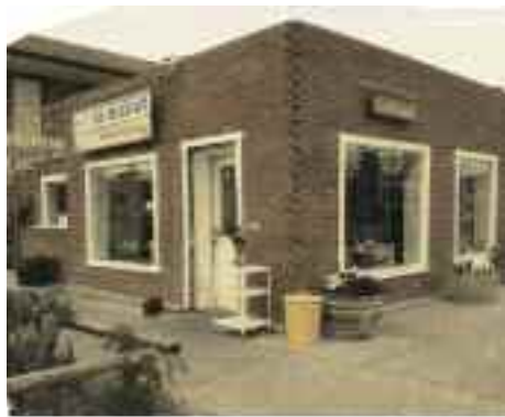
44) Award winning, always busy mom and pop breakfast spot serving traditional breakfast and lunch favorites with a focus on high quality, local and/or organic ingredients. www.mattsbigbreakfast.com

CARLY'S BISTRO, 128 E. ROOSEVELT ST, PHOENIX, AZ, 602.262.2759