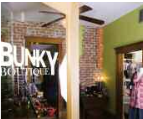
46) Contemporary, eclectic boutique specializing in men's, women's, children's apparel and accessories. Exclusive, well-known lines are featured along with innovative indie designers. Best New Boutique 2007. www.bunkyboutique.com

SENS, 705 N 1ST ST #120, PHOENIX, AZ, 602.340.9777