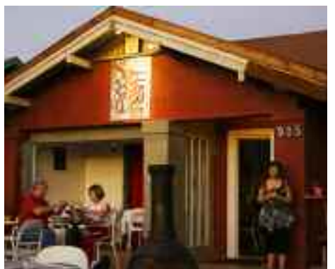
48) Well-crafted, modern Asian fare in a funky-chic setting. Great for late night dining in the Phoenix arts district. www.go2fate.com

THE ROOSEVELT, 816 N. 3RD ST, PHOENIX, AZ, 602.254.2561