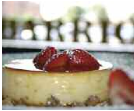
38) A little neighborhood eatery providing authentic southern Mexico cuisine and chef's original creations in a unpretentious atmosphere. www.barriocafe.com

TUCK SHOP, 2245 N. 12TH ST, PHOENIX, AZ, 602.354.2980