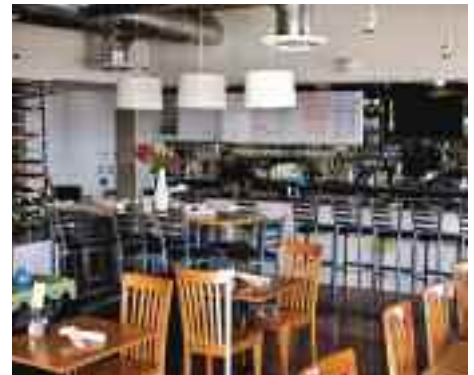
21) From the moment you walk through the door, you know you're in for an experience when you are enveloped in a crisp urban decor, full of life and energy. www.maiziescafe.com

COPPER STAR COFFEE, 4220 N. 7TH AVE, PHOENIX, AZ, 602.266.2136