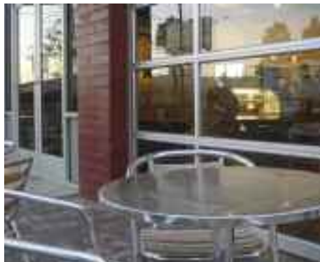
20) Vintage gas station in the Melrose District seeks coffee lovers only! Must like live music, fresh pastries & free wi-fi. See you at 6AM! www.copperstarcoffee.com

MELROSE VINTAGE, 4238 N. 7TH AVE, PHOENIX, AZ, 602.636.0300