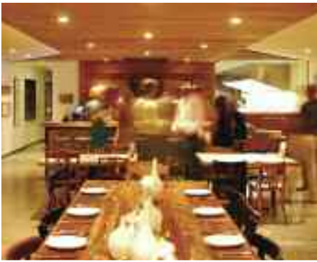
37) Serving supper and beverages to the neighborhood using local and organic products. We are the restaurant you wish was down the block from your home. Tues-Sat 5-10 PM www.tuckinphx.com

TUCK SHOP, 2245 N. 12TH ST, PHOENIX, AZ, 602.354.2980