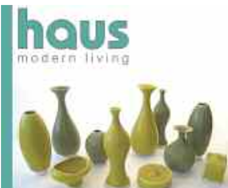
22) Haus, distinctive modern furniture, accessories, and a wide array of gifts to fit into any modern lifestyle. Featuring Knoll, Jonathan Adler, Moroso, Kartell, and Alessi. www.hausmodernliving.com

MAIZIE'S CAFÉ & BISTROT, 4750 N. CENTRAL AVE, PHOENIX, AZ, 602.274.2828