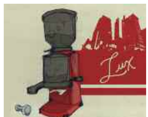
24) We provide guests with the highest quality coffee and bakery goods, in an atmosphere where art, music and design are cultivated to create a place of culture and shared ideas. www.luxcoffee.com

PANE BIANCO, 4404 N. CENTRAL AVE, PHOENIX, AZ, 602.234.2100