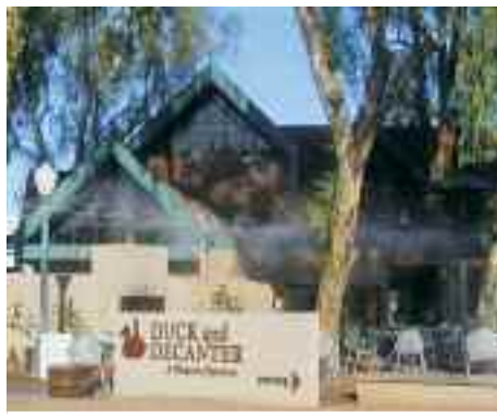
14) Celebrating 36 years of award winning sandwiches, soups and salads surrounded by an epicurean marketplace purveying unique gifts, specialty foods and wine. www.duckanddecenter.com

URBAN SOUTHWEST, 1016 E. CAMELBACK RD, PHOENIX, AZ, 602.266.3311