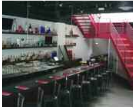
42) Premium Drinks and American pub style menu one block away from the U.S. Airways Center in the heart of downtown. Chill outside loft and private V.I.P. room available. www.barsmithphoenix.com

FAIR TRADE CAFÉ, 1020 N. 1ST AVE, PHOENIX, AZ, 602.354.8150